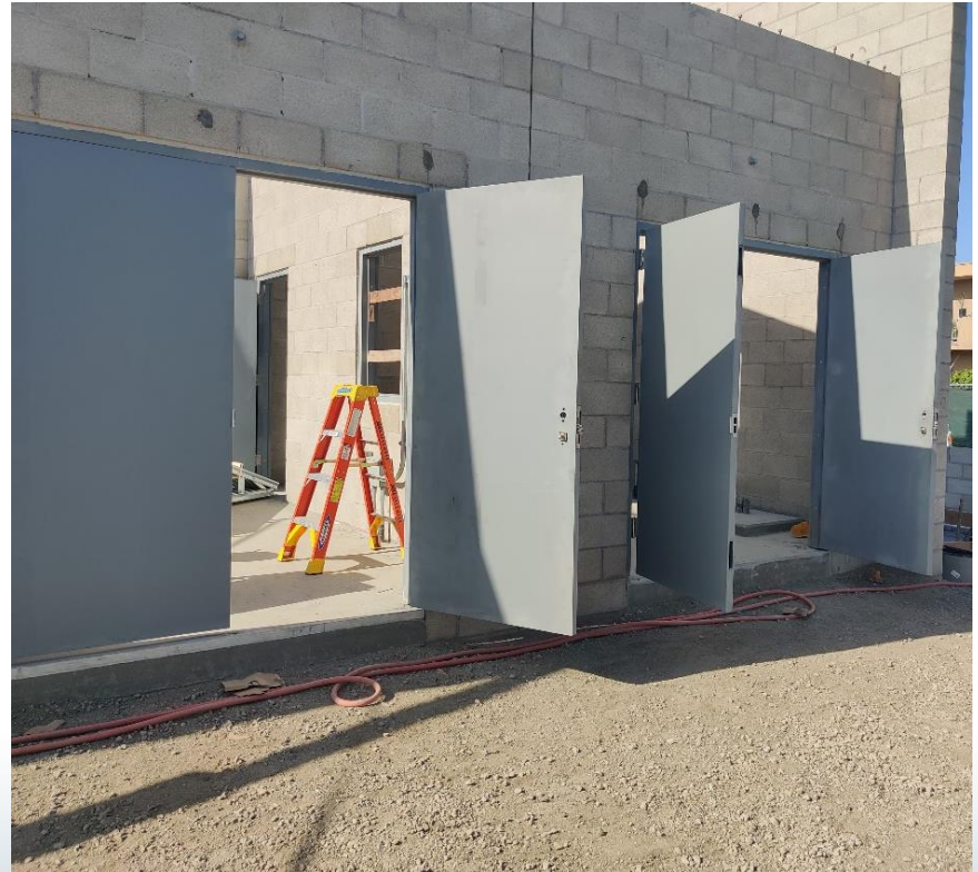
Frame, Doors & Windows