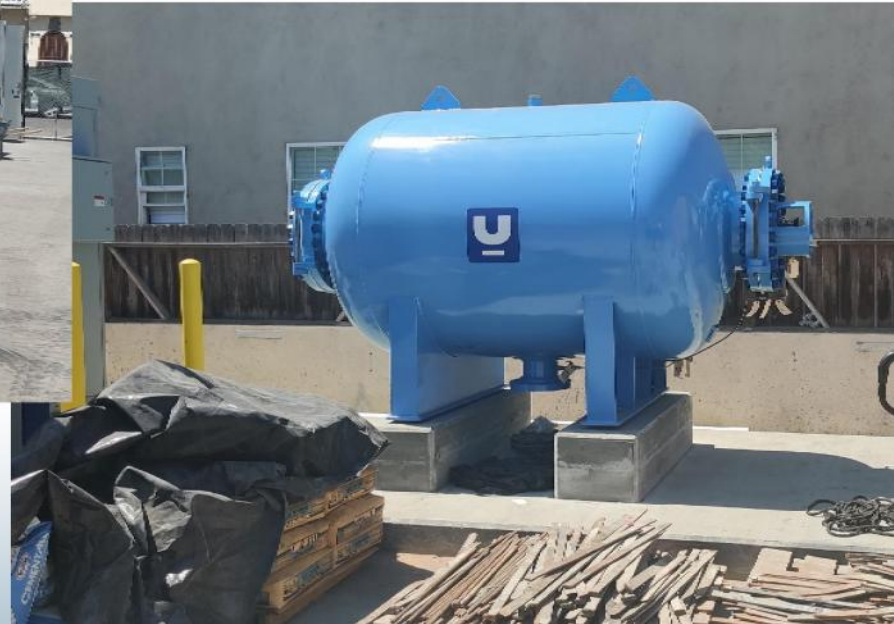
Exterior Wall and Bladder Surge Tank