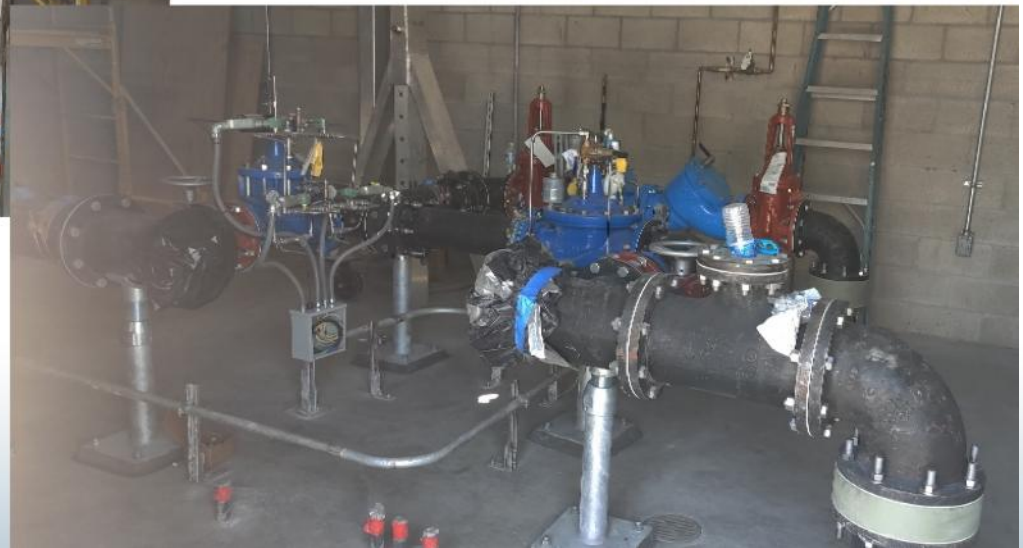
Interior Piping and Electrical