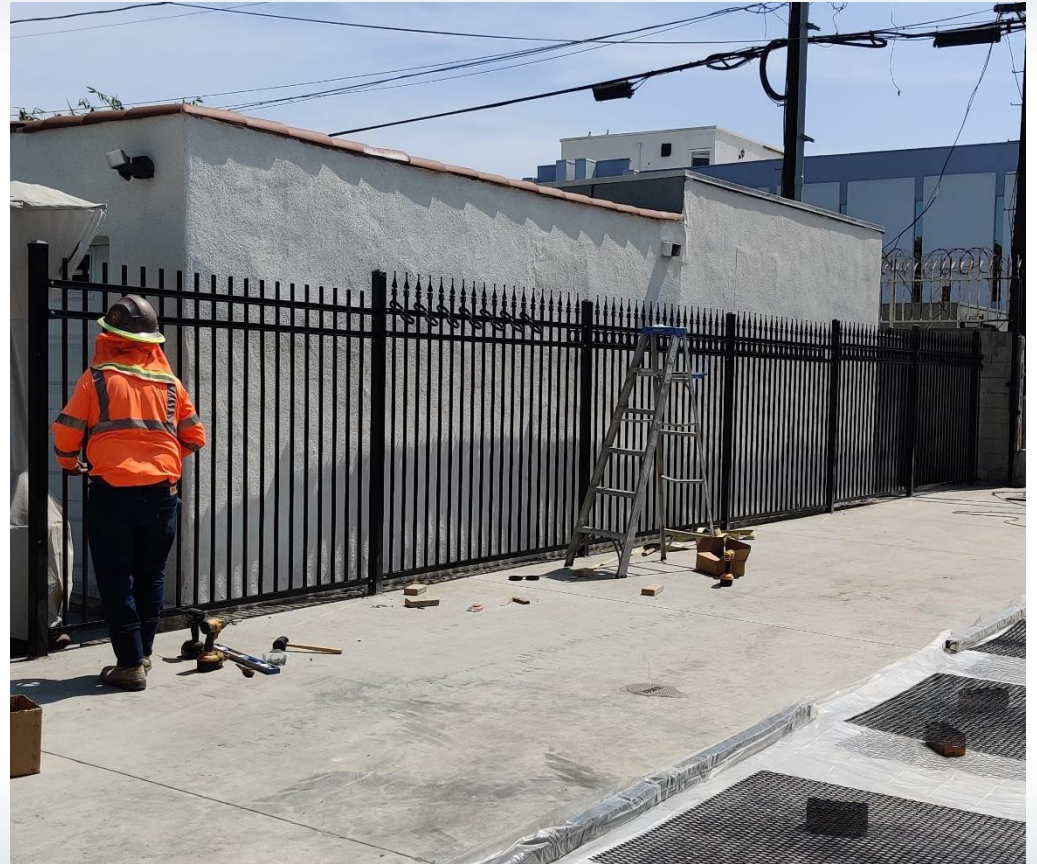
Building Exterior and Perimeter Fencing