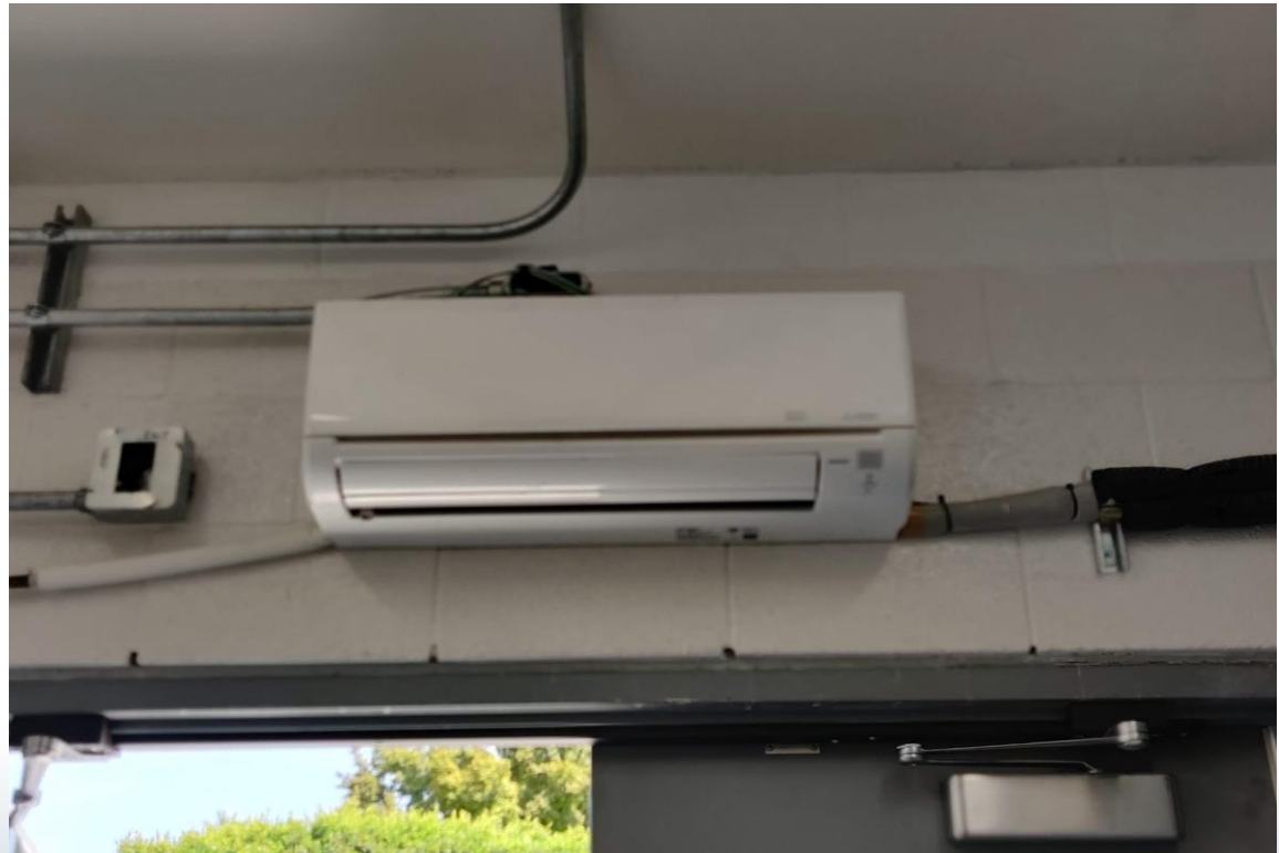
Interior Piping and Electrical